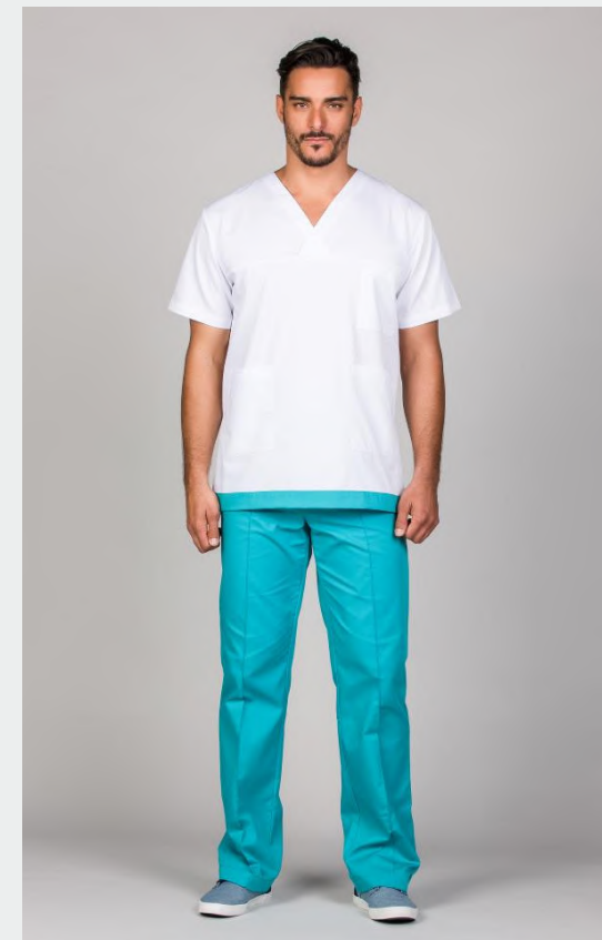
Men's scrub top