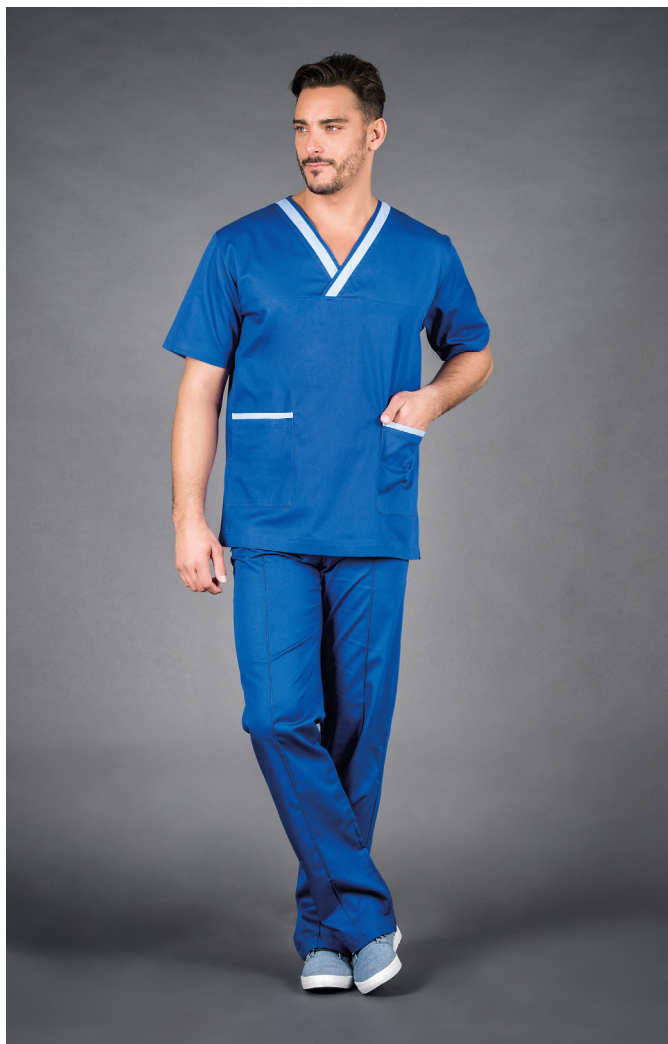
Unisex scrub top