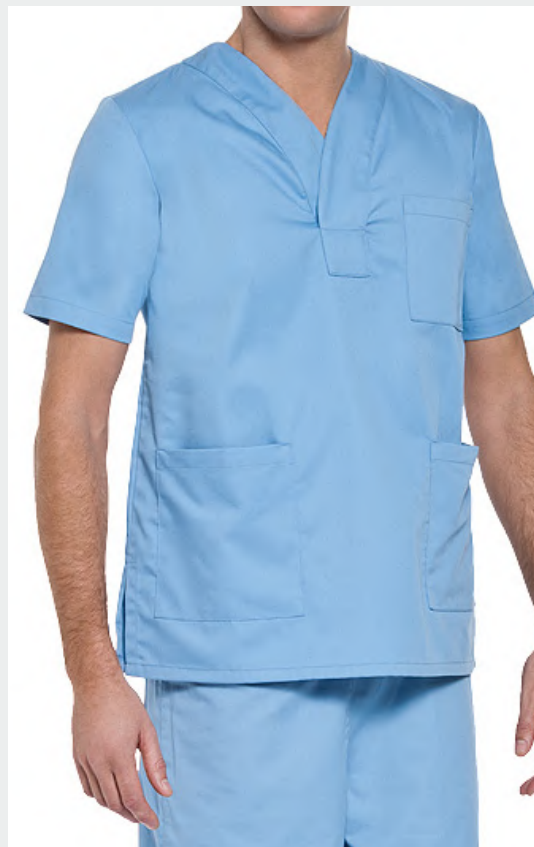
Unisex scrub top