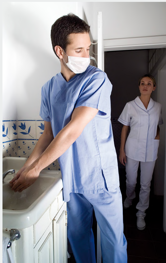
Men's scrub top