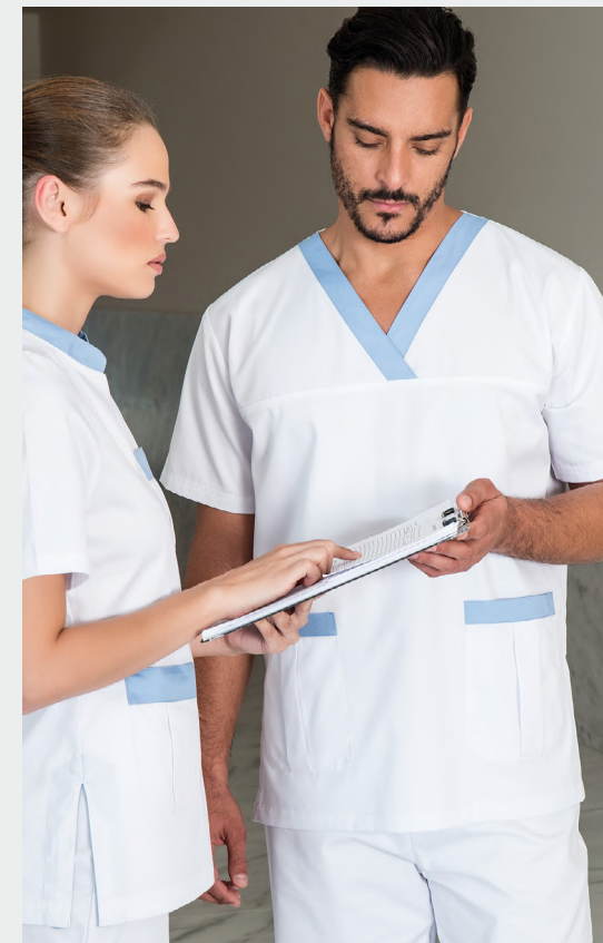
Unisex scrub top