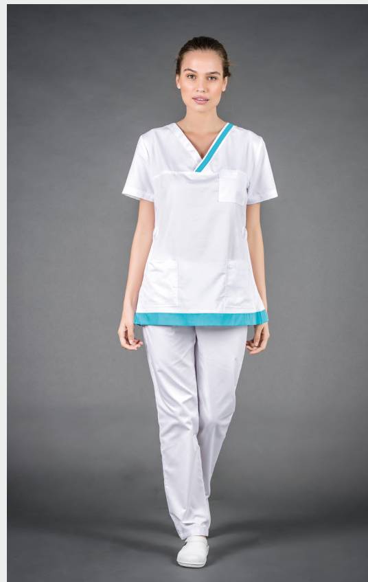
Women's scrub top