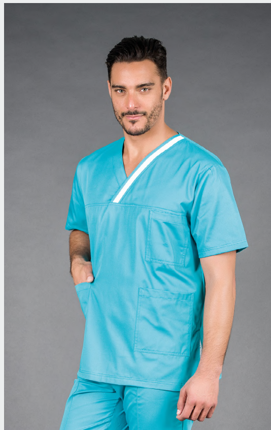
Unisex scrub top