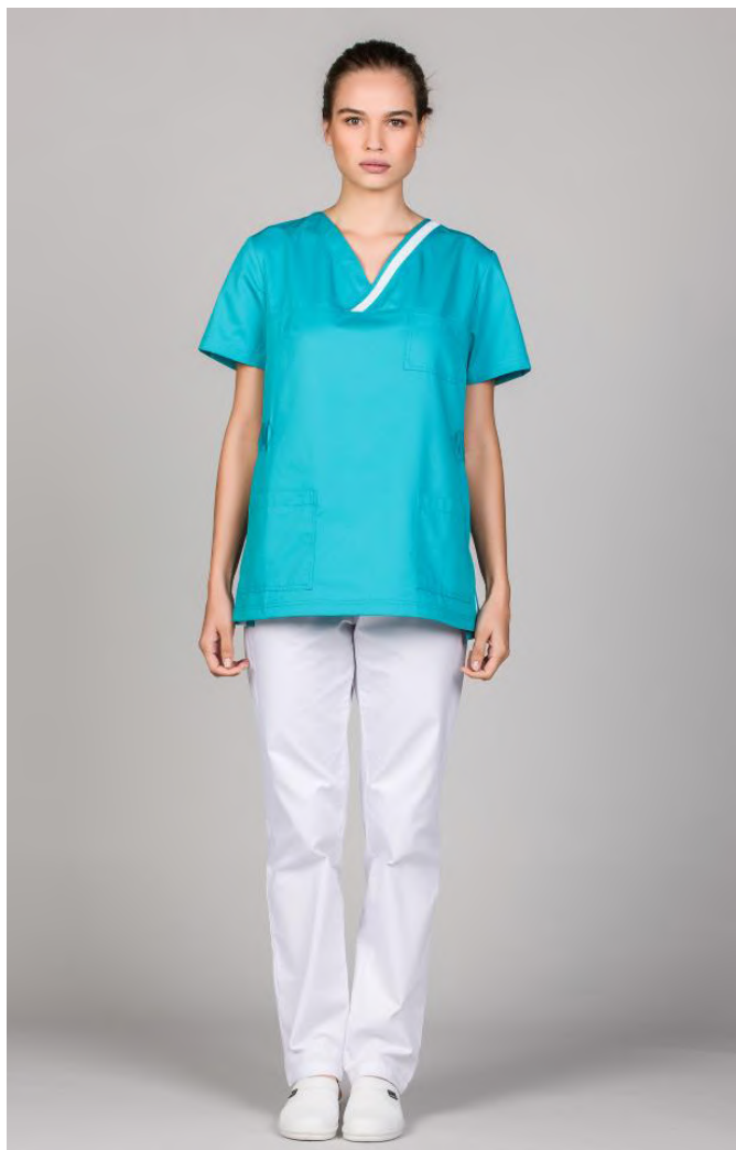
Unisex scrub top