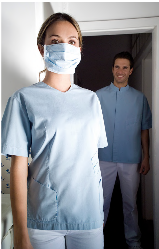
Women's scrub top