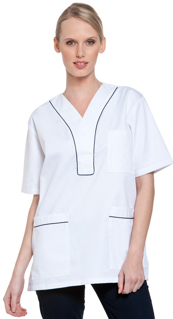
Unisex scrub top w/ piping